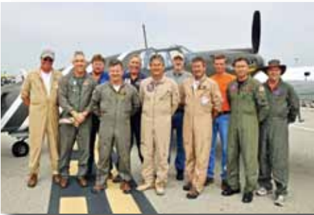
The Planes of Fame pilots are ready to put on another awesome Airshow!