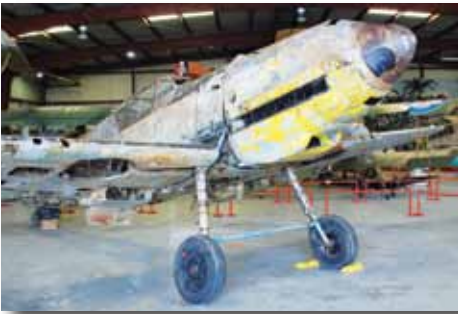
Messerschmitt Bf109 lifted out of a Russian lakebed in 2003 is now on display.