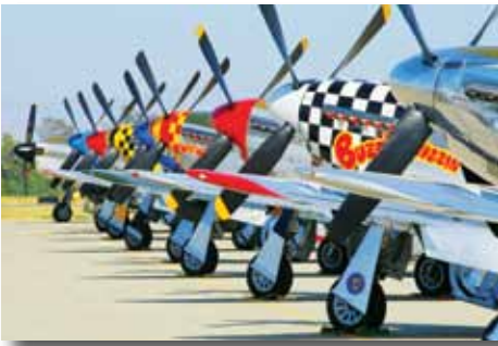
Mustangs ready for their "mass gaggle" flight during the PoF Airshow 2010.