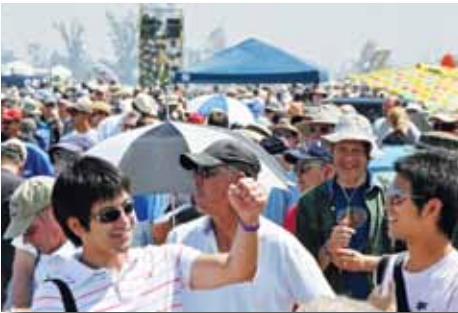
The largest Planes of Fame Airshow crowd EVER having a fantastic day.